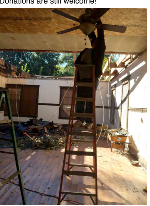
A recent photo of the meeting room shows the roof & ceiling damages.

The archives suffered a double whammy recently when flood waters were followed by a large tree falling on the meeting room. However, due to volunteer efforts, donations & good insurance coverage (tree, not flood), the archives is recovering. Please be patient as we work to make the archives even better. Donations are still welcome!